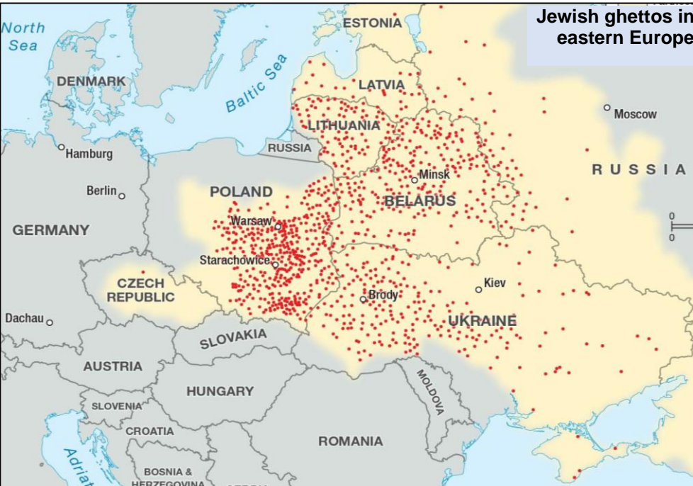
Jewish ghettos in eastern Europe